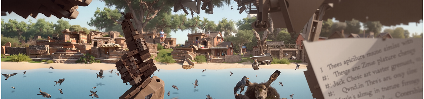
Figure 1: Screenshot of Prosomoíosi (Simulation)