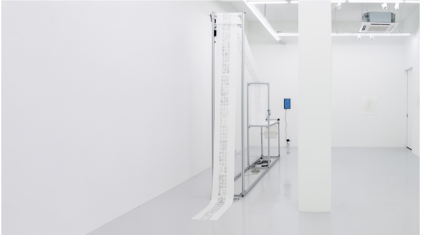
Figure 1: Installation view of Cloud Scripts, 2024.

Kian Peng Ong Nanyang Technological University singapore, Singapore kianpeng.ong@ntu.edu.sg