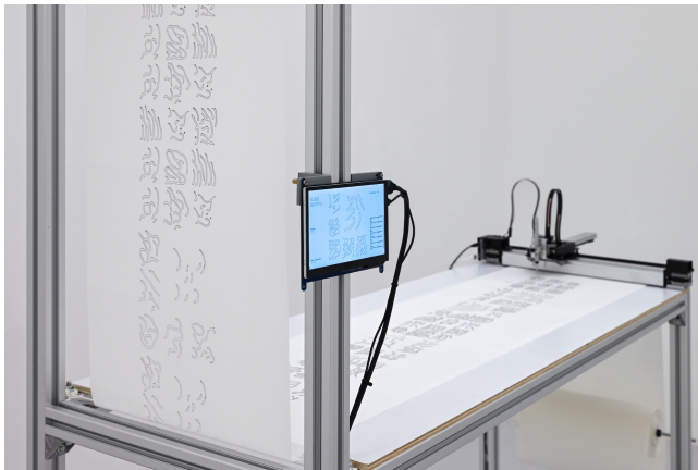
Figure 2: Interface display of Cloud Scripts. A new talisman is generated every 15 minutes

This perspective inspired CLOUD SCRIPTS, a generative art installation and conceptual machine that explores the asemic nature of Daoist Cloud Seals as a form of communication between humans and the spiritual world. Rooted in shamanistic traditions from the pre-Han period, Cloud Seals draw inspiration from cloud formations, which were believed to embody the movements of spirits. By extracting a corpus of Cloud Seals from Daoist scriptures and training them using machine learning, the installation generates a series of talismans. These talismans, intentionally devoid of specific pictorial meaning, symbolize my attempt to engage in a dialogue with the spiritual realm. The data and software that I create function as a letter to the spiritual world, articulated through the medium of machines.